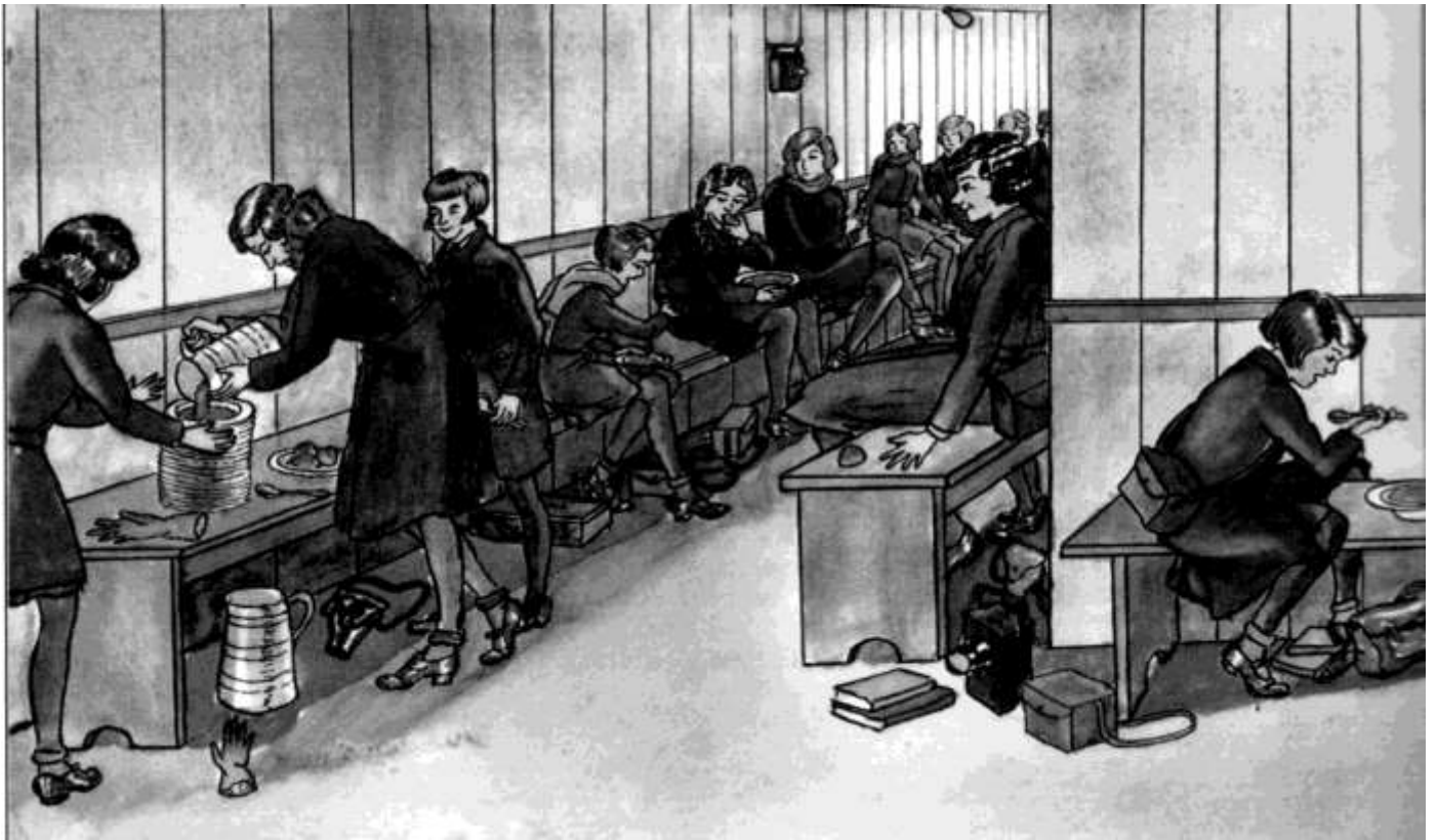
Dinner In The Trenches, 1940.