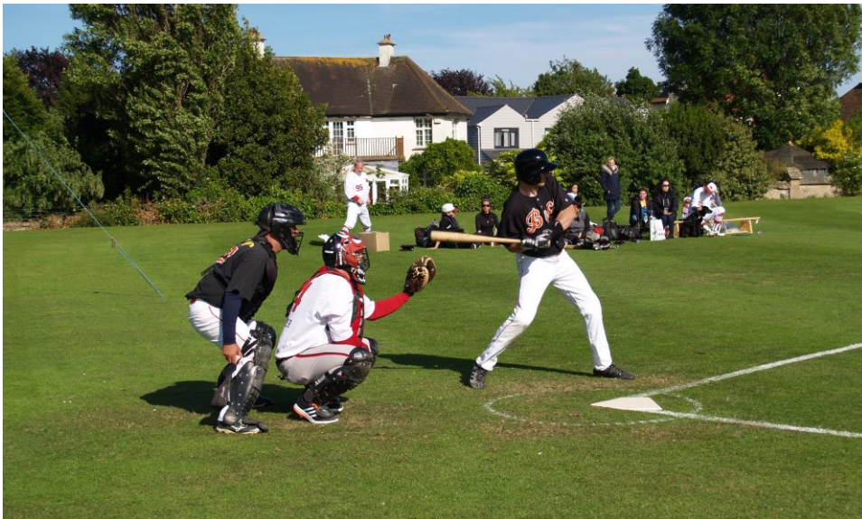
Baseball being played at the Three Hills, Folkestone 16 th June 2019

Thirty people attended the meeting three of whom were visitors.