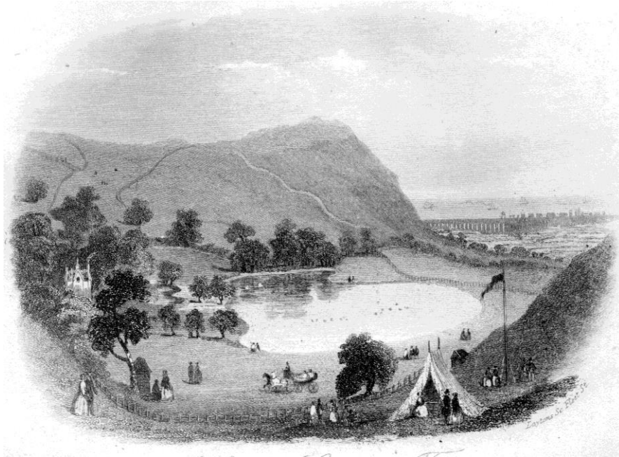
The Cherry Garden, 1860

After sterilization with chlorine, water from this station is supplied to lower and west Folkestone. The original 9” diameter cast iron pipe to Folkestone Town Hall laid in 1848 is still in use, but subsequently an 18” diameter pipeline has been laid alongside and other large mains to the east and west Folkestone.